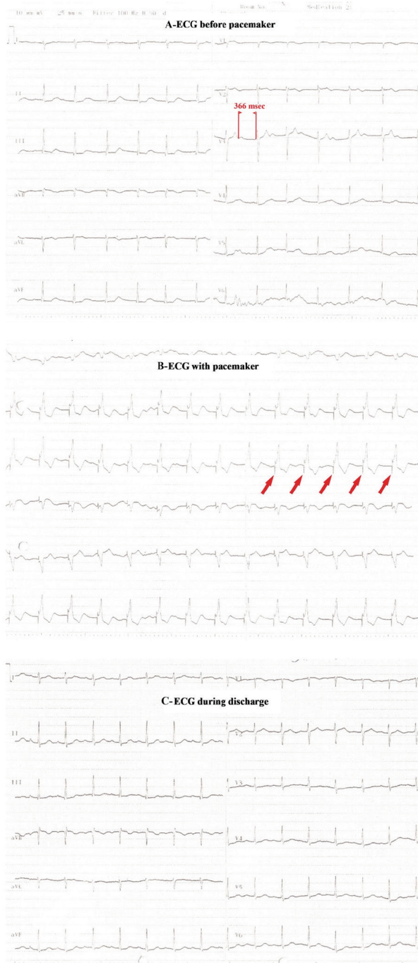
Figure 1. Three different electrocardiographs of the patient's treatment process. A) ECG of the patient before pacemaker application (The red marks show the distance between PR; 366 msec, first degree AV block). B) ECG of the patient after pacemaker application (The red marks indicate pacemaker spikes.). C) ECG of the patient after discharge

ECG: Electrocardiography, AV: Atrioventricular