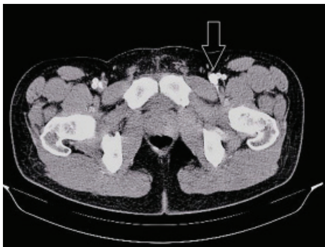
Figure 1. Computerized Tomography (CT) Angiography scan. Arrow is showing the opaque extravasation out of the left common femoral vein laceration.

Despite their rate is low among all injuries, bull gorings tend to be fatal. Major vascular injuries to the limbs caused by this type of penetrating traumas often involve the arteries. [2,5] However, these vascular traumas, being either arterial or venous, need a prompt and precise intervention. [6] Injuries and even deaths caused by bulls can also be seen in Kars province, the easternmost part of Turkey, where farming and livestock rearing are widespread practiced. An isolated injury to the femoral vein caused by an inguinal bull gore has not been reported so far in the available literature. In this article, an unusual case of an isolated femoral vein injury due to bull gore without any arterial or neurologic involvement and its successful surgical treatment are presented.