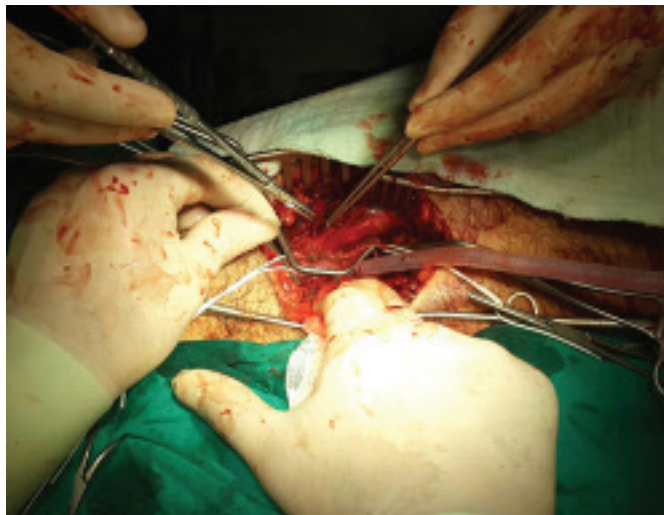
Figure 4. Patterns of bull gore injuries in different countries